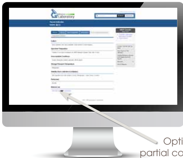
Option 2: partial co-branding