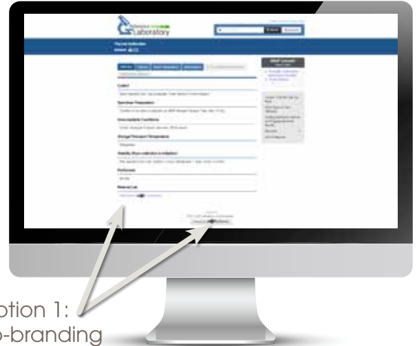
Option 1: full co-branding