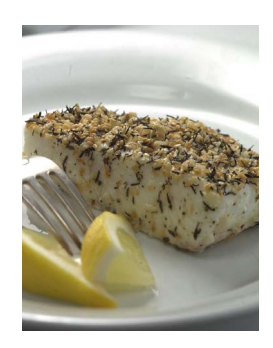
Thyme- & Sesame-Crusted Halibut